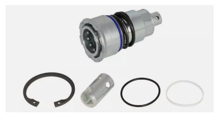
Part # 4DCPV-08